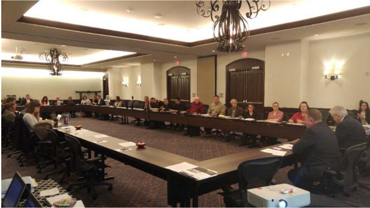
PHOTO SPOTLIGHT: The TETAF General Assembly met in San Antonio on Dec. 14.