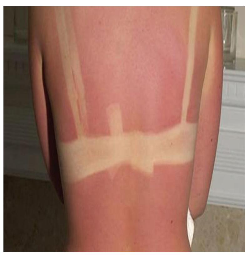
First Degree Burn